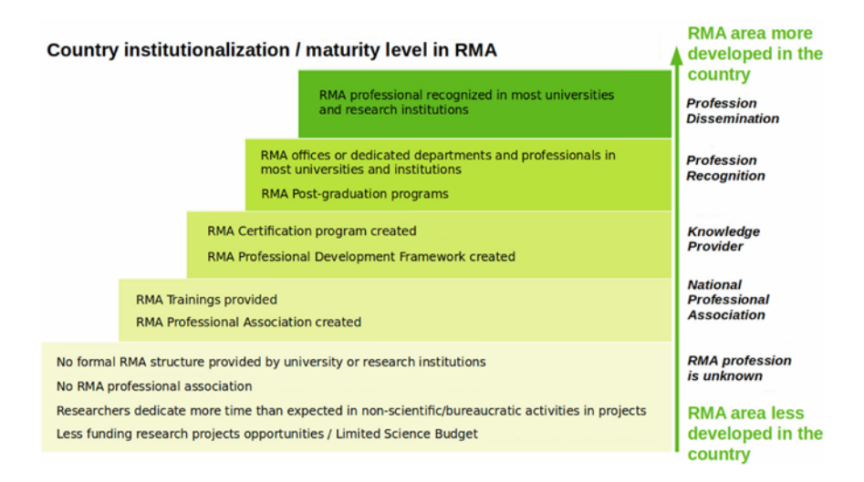
Fig. 3.2.2. Country Institutionalisation and Professional Maturity Level in RMA.

Thus, Fig. 3.2.2 suggests an exemplification of some of the points set above to show how some institutional elements related to RMA in a country can be directly regarded as indicators of the maturity of the profession in that area.