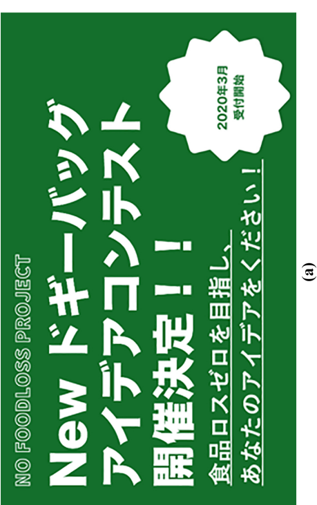
Figure 3. (a) Online Doggy bag contest; (b) Doggy bag app operational through QRC identification