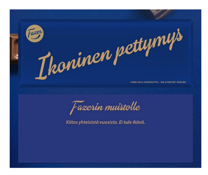
Notes: Translation: "Iconic disappointment. To the memory of Fazer. Thank you for our years together. You won't be missed"

Figure 3. Screenshot posted on Twitter of the campaign's service that allowed customers to design their own Fazer Blue wraps