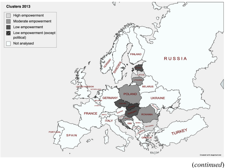
Figure 2. Countries of CEE based on masculinity as cultural dimension and female empowerment

said to have increased. However, there are still countries – like Estonia – where even though women are better educated, they still struggle with employment inequity. The pay gap between men and women increases and their involvement in senior positions is still insufficient. Hungary and Romania have not deteriorated, but neither have they made significant improvement. However, these countries are on a path to closing the pay gap and accommodating more women in senior positions.