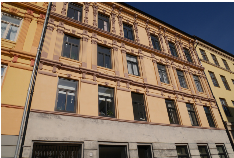
Plate 1. Facade of the case study building block

At a national level, the Directorate for Cultural Heritage is responsible for the management of all protected archeological and architectural buildings, monuments, sites and cultural environments in accordance with relevant legislation. Each county employs officers