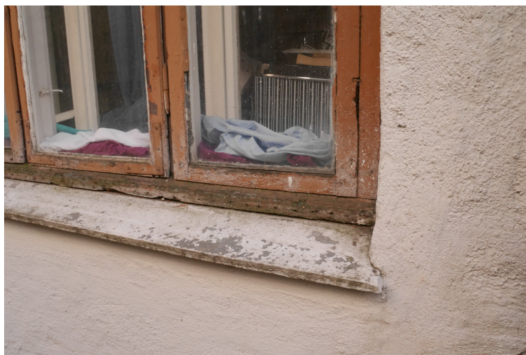
Plate 2. Residents use fabrics to avoid drafts from the old windows

responsible for cultural heritage conservation in connection with the administration of cultural affairs in general, to advise the county administration in cultural conservation questions and to ensure that protected monuments and sites and cultural environments are taken into account in the planning processes. Enova, a public enterprise owned by the Ministry of Petroleum and Energy, aims to drive forward the changeover to more environmentally friendly consumption and generation of energy in Norway. How do