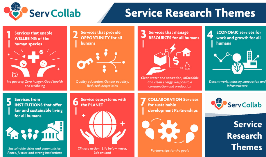
Figure 1 ServCollab's service research themes and UN SDGs