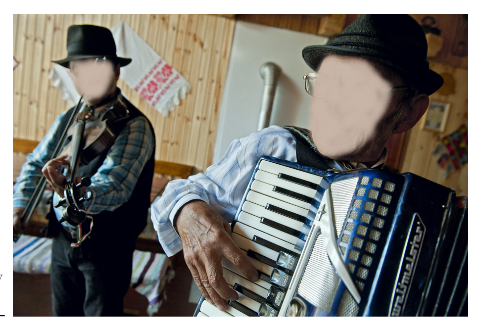
Figure 2. Musicians in Sâncraiu; by courtesy of Michael Schneeberger

Role of tourism in the economic and social development of the rural local community. The yearly (since 1991) organized traditional dance and music festival (Figure 2) had a major impact on the development of Sâncraiu as a tourist destination, which contributed largely to the visibility and appreciation of the village. This event showed the need for