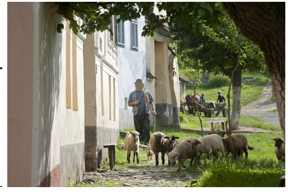
Figure 3. Viscri streetscape

I was interested in helping my community. I wanted to help people to have a better life in my village [...] When the Saxons all left for Germany, we decided not to leave. For two reasons: to try to preserve what our ancestors did in the past and I thought that we had the opportunity to live in a democracy and do something for the community.