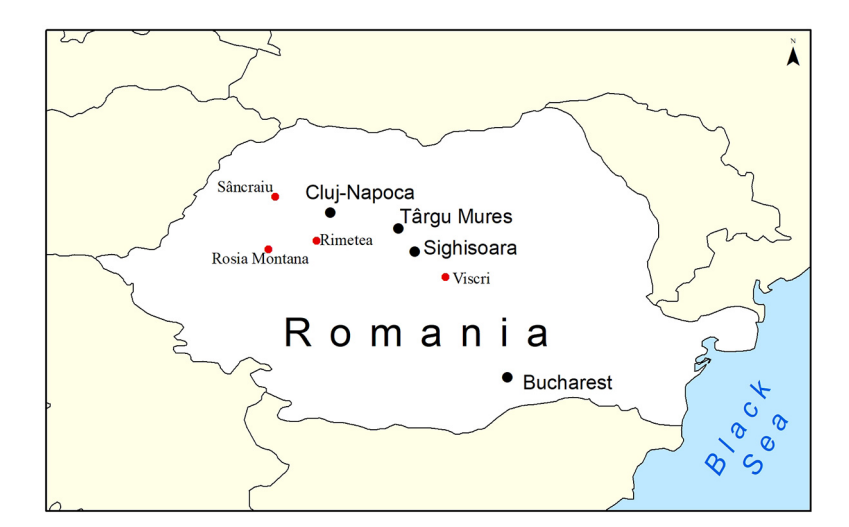
Figure 1. The location of the investigated settlements

Because we have been visiting these four municipalities during the past six years, we were able to assess the evolution of tourist activities and to observe chances and challenges of the endeavours.