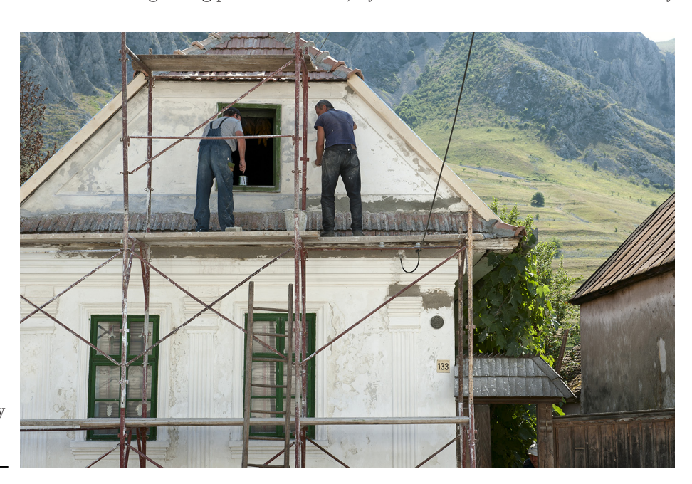
Figure 4. Rimetea, rehabilitating traditional houses

In this context, certain locals and external activists, with a strong link to the settlement because of the long-lasting protest movement, try to infuse life in the remained community