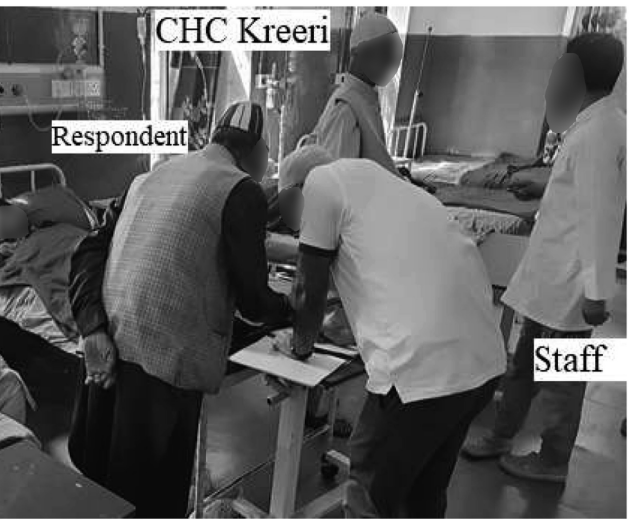
Figure 2. In-patient department