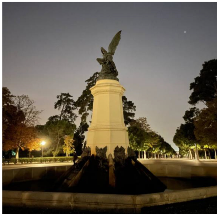
Plate 3 The fountain of the fallen angel