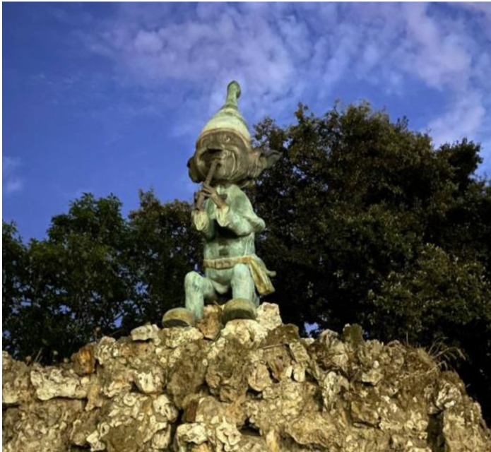
Plate 1 Goblin's statue at Retiro Park

The last section of the tour ends with the guide sharing, what they consider to be, real psychophonies recorded by the guards of the Casón del Buen Retiro , a former museum, where the tour ends. None of these commercial tours aim to convince customers that ghost hunting is real; instead they portray that hunting is a possibility, which keeps their expectancy levels high ( Edwards, 2019 ). All the featured mysterious stories may or may not be fictional, but they do serve to maintain the popularity of the sites.