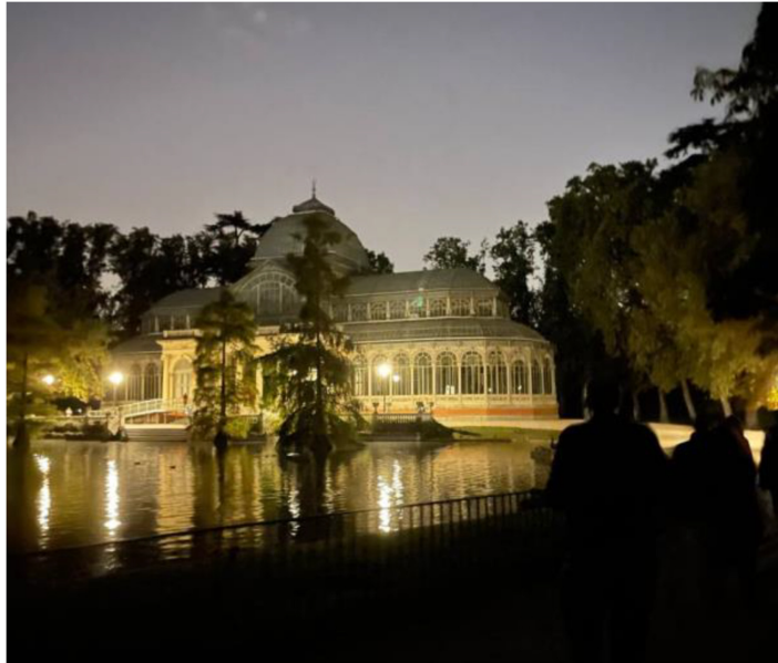
Plate 2 Retiro's Crystal Palace at night