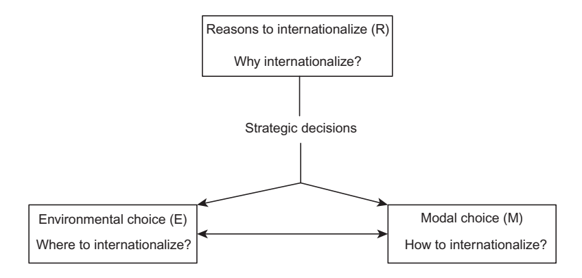
Figure 1. REM Model.

sales, and service) (Porter, 2008, p. 75). However, this aspect cannot be explained theoretically by institutional distance, the central variable of this study. Thus, this book will focuses on the impact of institutional distance on the two strategic decisions of location and entry mode, as in Xu and Shenkar (2002) — other determinants (e.g., the reasons to invest abroad) are considered as control variables.