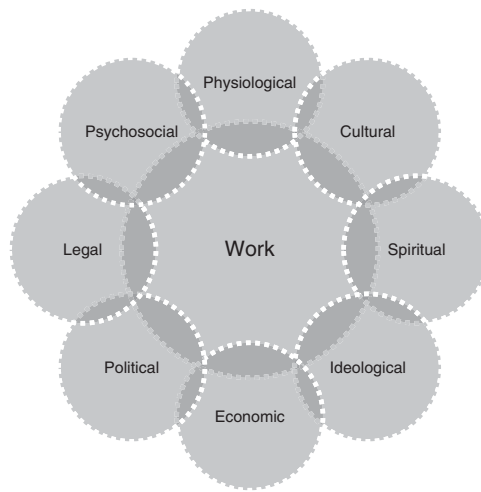
Figure 1. Perspectives of work