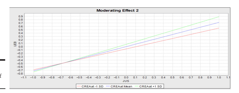
Figure 3. Moderating effect of CCI