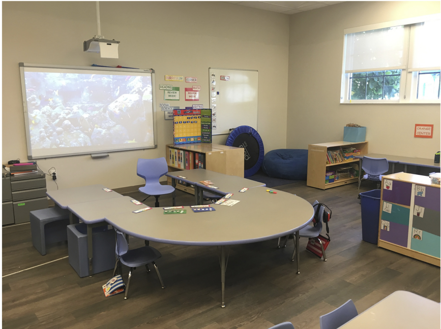
Plate 2. Image of the ASPECTSS compliant classroom layout showing the group activity space