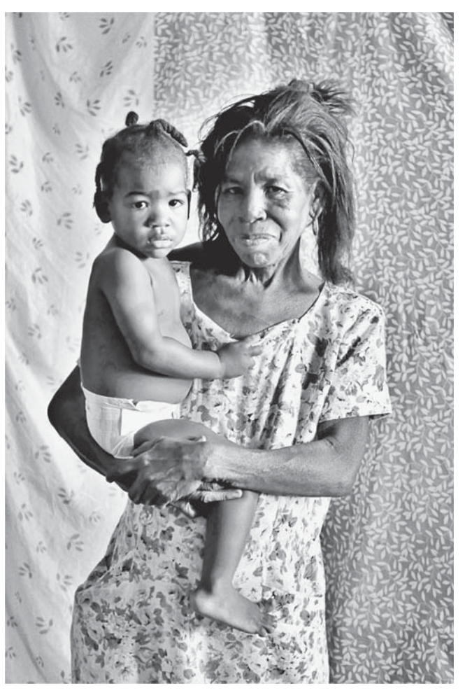
Note: Mother works in tourism industry, still in recovery Source: Scotts Head, Dominica

The purpose of this essay is simply to document and communicate through a visual tool the post disaster context of a specific affected population. Despite the limitations of this exercise, we believe it could trigger a stimulant way to document disaster risk impacts in many other places (Plates 1–10).