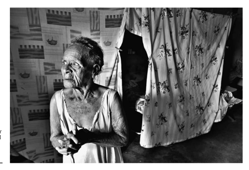
Plate 3. This 60-years old women lives in shelter with her husband and other families in Castle Bruce, Dominica