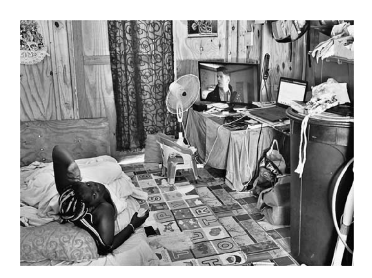
Plate 7. In a recovering economy job are rare and precarious, according to this 18-years old girl in relatively more equipped shelter in the capital, Roseau, Dominica