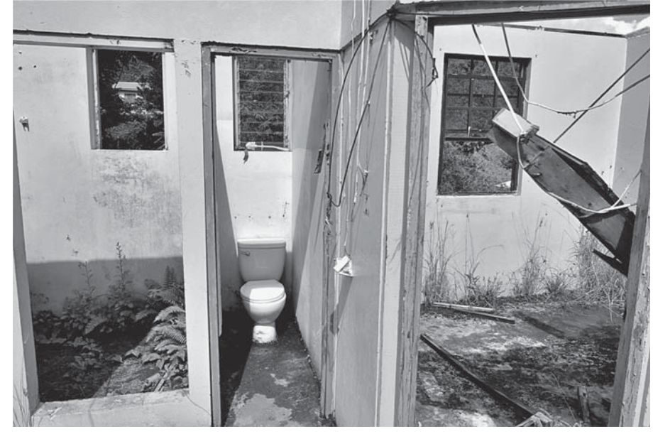
Plate 2. A large number of homes remain in ruins along the island