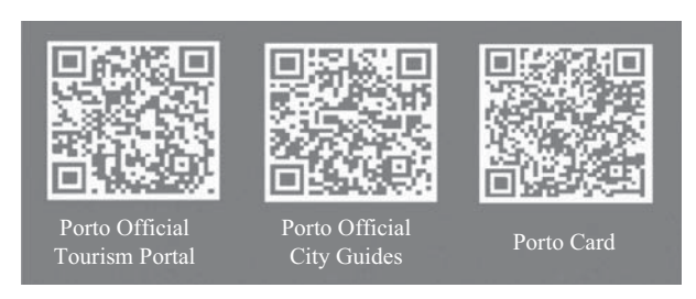
Figure 2. Examples of use of the QR code