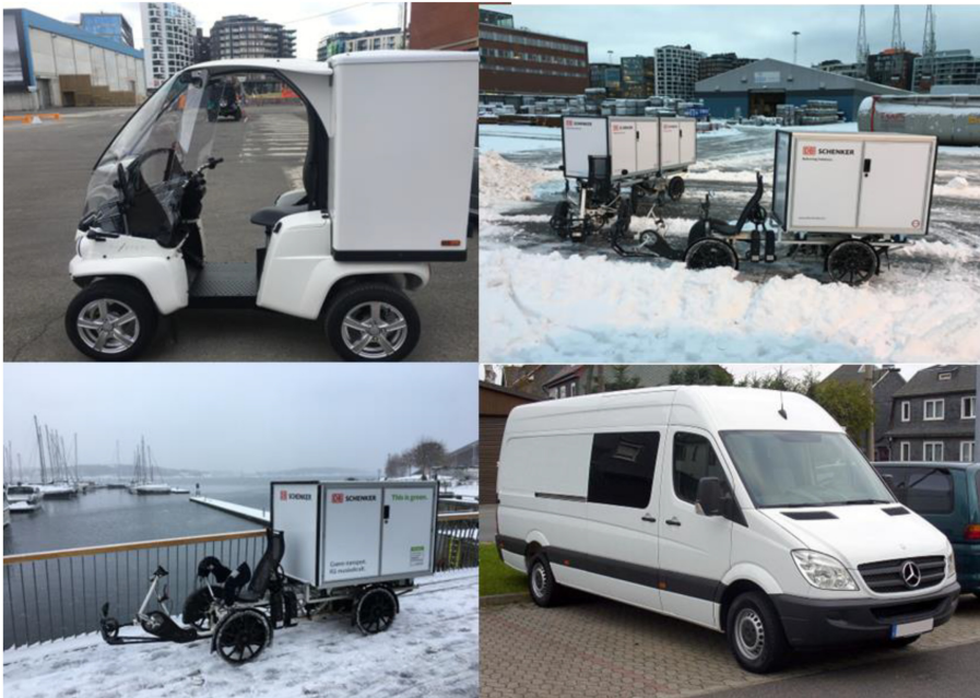
Figure 1. Examples of light electric freight vehicles (LEFVs) and a van commonly used for distribution (white labeled)