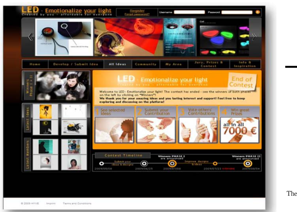
Figure 2. The LED emotionalize your light design contest