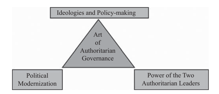
Figure 1. Interlocking relationship of the three main components as Lee Kuan Yew's and Deng Xiaoping's authoritarian governance

To help better ponder both the historical background and the casual relationship among the above-mentioned central issue and also two key issues to the formation of such a successful authoritarian governance, the rundown of this paper is to combine long-term, together with short-term, historical factors that simultaneously affected the duo's political behavior, in the purpose of formulating their "die-hard" beliefs on the good of authoritarianism to be an unshakable art of governance while setting up their good governments as time goes by (Figure 2). In terms of long-term historical factors, they could be related to how the research subjects (Lee Kuan Yew and Deng Xiaoping) in specific timeframe (after the Second World War) and specific space (Asia). Long-term historical factors include political, economic and social institutions, which have lasted for hundreds or even thousands of years. Needless to say, long-term historical factors would inevitably affect individuals' situation, i.e., short term historical factors, and stimulate the unique situational-condition in Singapore and China, which differed from Democracies in the West. By the end of this paper, the author hopes to explore if there is room to practically establish a good but authoritarian government in the East.